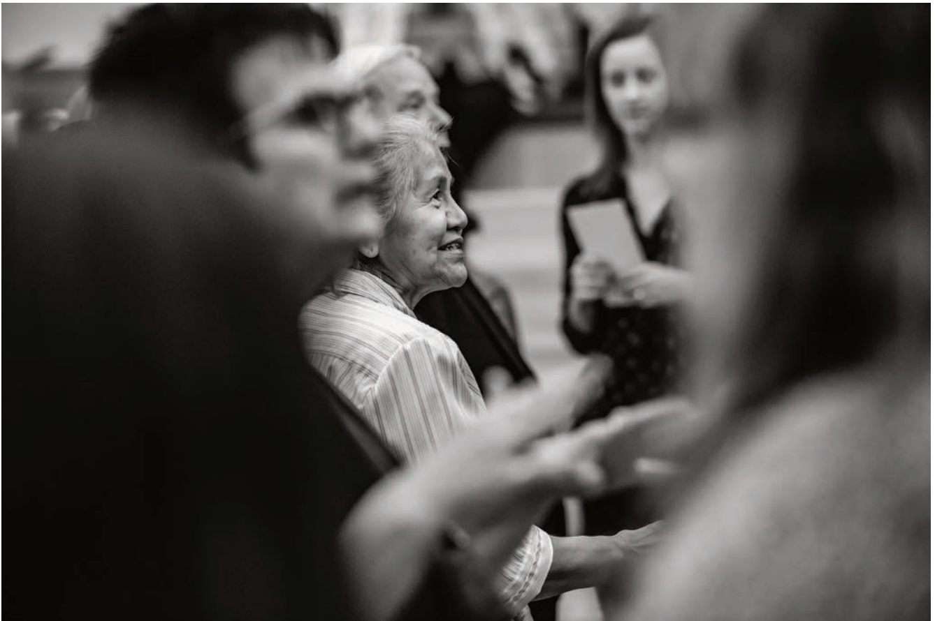
Fig 2.1: Indigenous graduate reception.