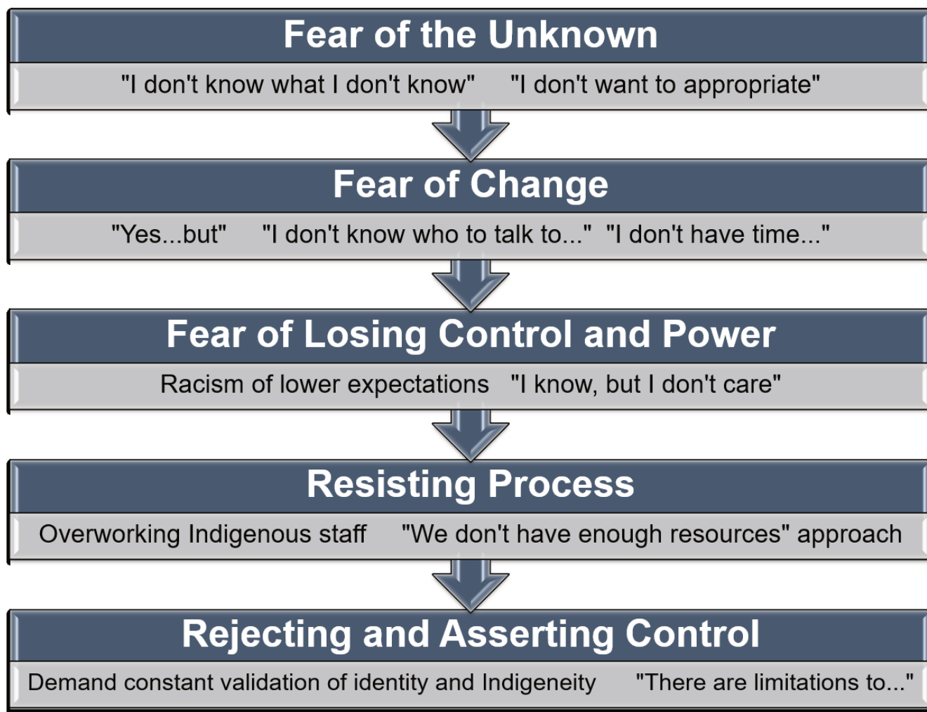
Fig 4.2: Levels of Indigenization. [Long Description]

Here are some strategies to keep in mind to help you overcome these challenges and barriers: