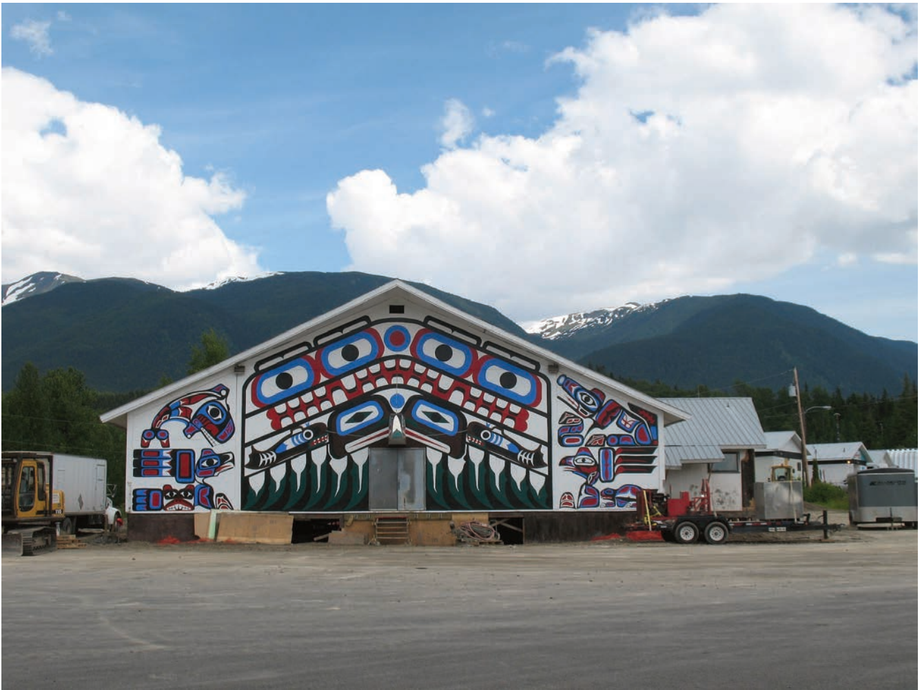
Fig 4.1: Traditional Nisga'a house in New Ayanish.