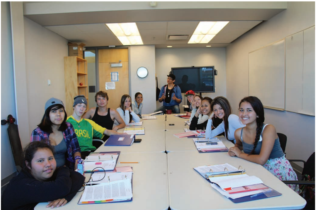
Fig 1.1: Aboriginal math/English camp.