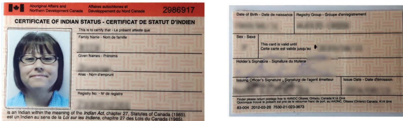
Fig 1.2: Status identity card.

all Indigenous graduates are “non-status” and live off reserve (Statistics Canada, 2011). There are multiple stories and factors behind these statistics that demonstrate the inequity of the Indian Act.