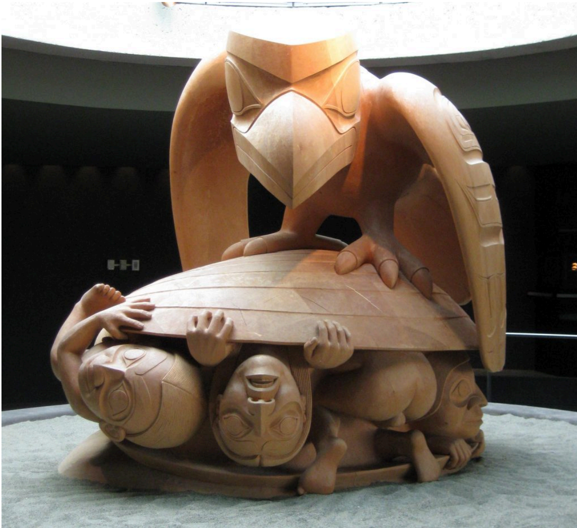
Fig 1.1 "Raven and the First Men" by Bill Reid, Museum of Anthropology, UBC, Vancouver, British Columbia