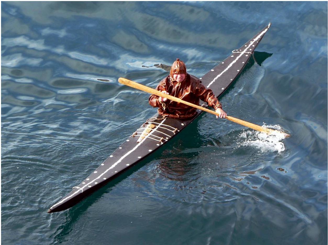
Fig 4.1: Inuit Kayaker