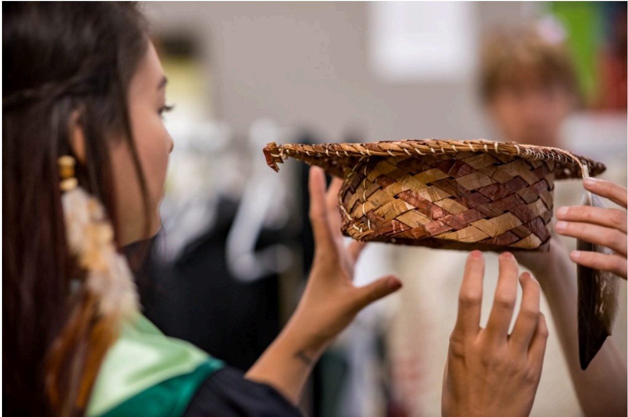
Fig 5.1: UFV Indigenous Graduate Reception 2017