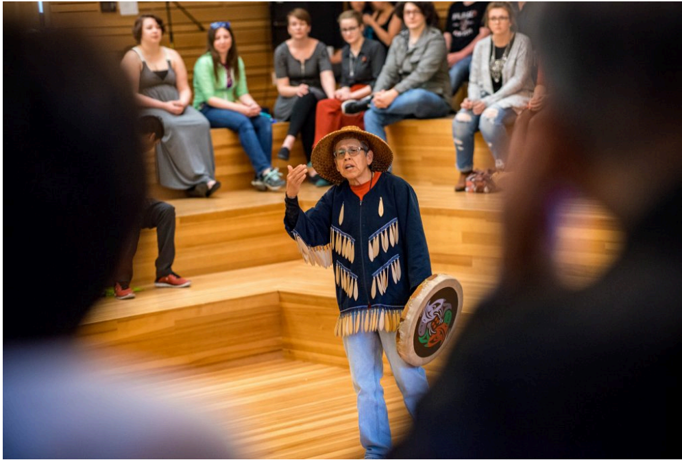
Fig 3.1: Indigenous Graduate Reception