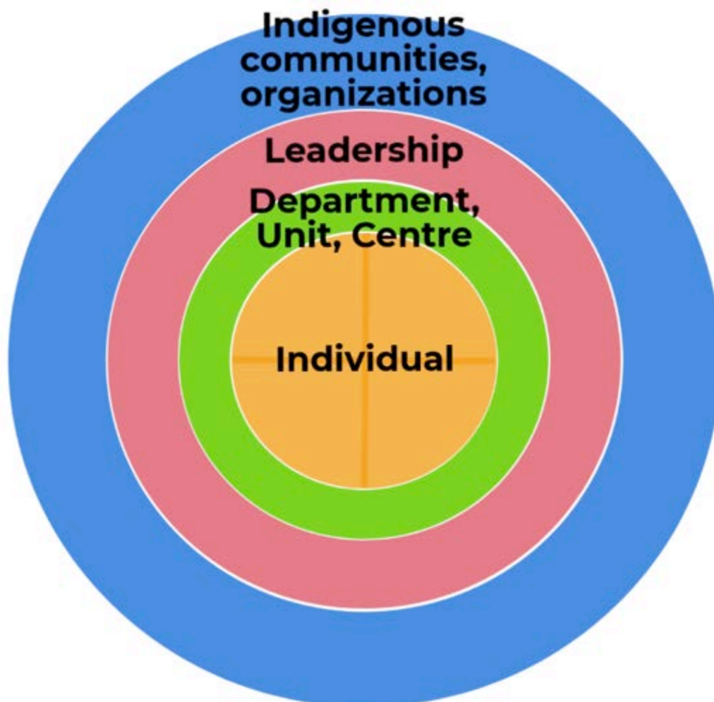
Fig 2.2: Institutional interconnections to Indigenization.

Indigenization in practice is deeply grounded in the traditions and cultural protocols of the traditional landholders that an institution is built upon; it is informed by the diversity of First Nations, Métis, and Inuit of Canada.