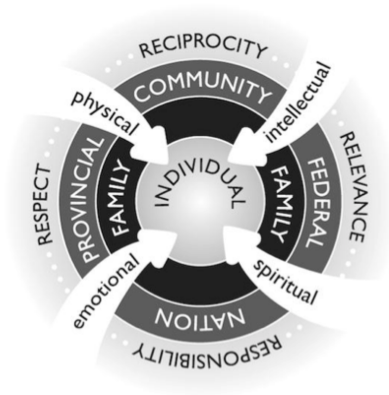
Fig 2.2: Indigenous wholistic framework.

This Indigenous wholistic framework provides guiding principles to ensure post-secondary institutions become accessible, inclusive, safe, and successful places for Indigenous students as follows: