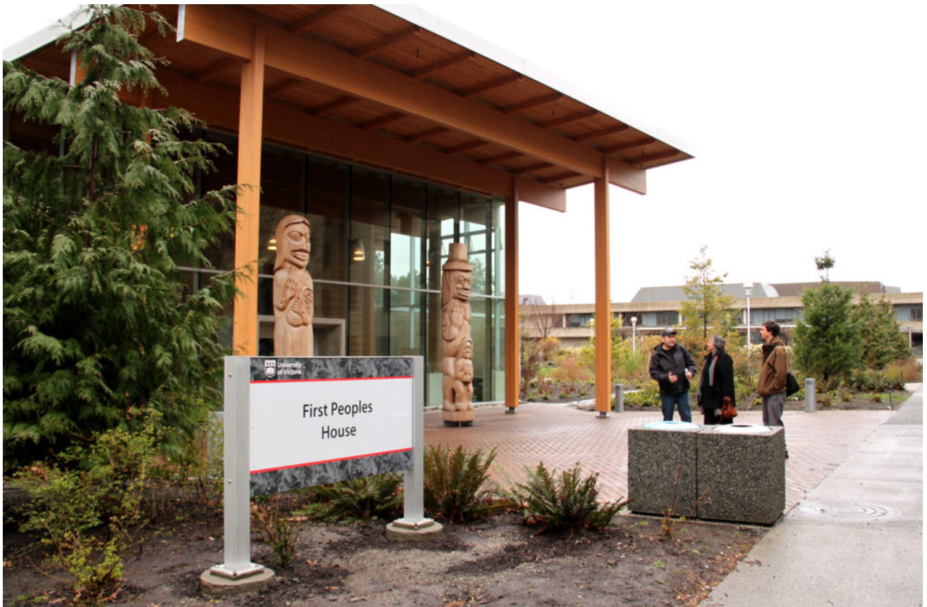
Fig 1.1: First Peoples House, University of Victoria.