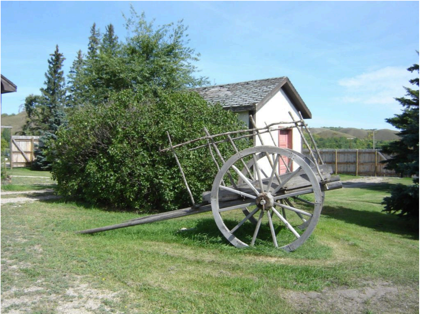
Fig 3.1: Red River Cart at RE-built fort at Fort Qu'Appelle Saskatchewan.