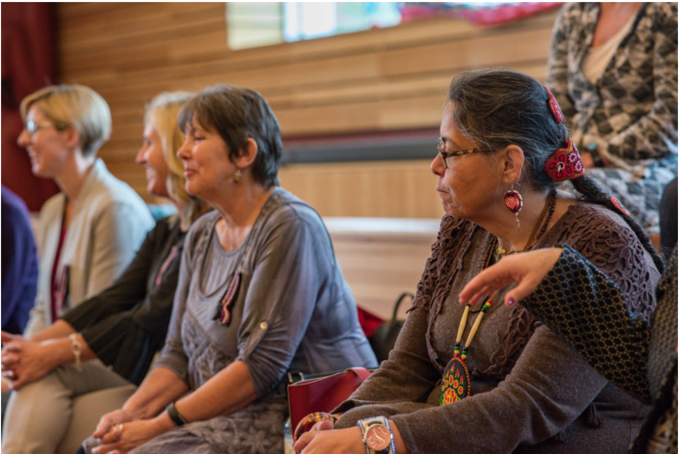
Fig 4.1: UFV – Metis Nation-BC Joint Project Announcement.