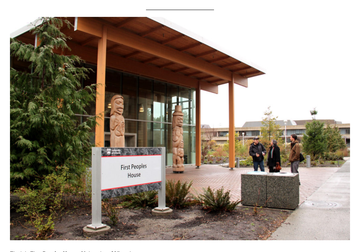
Fig 1.1: First Peoples House, University of Victoria.