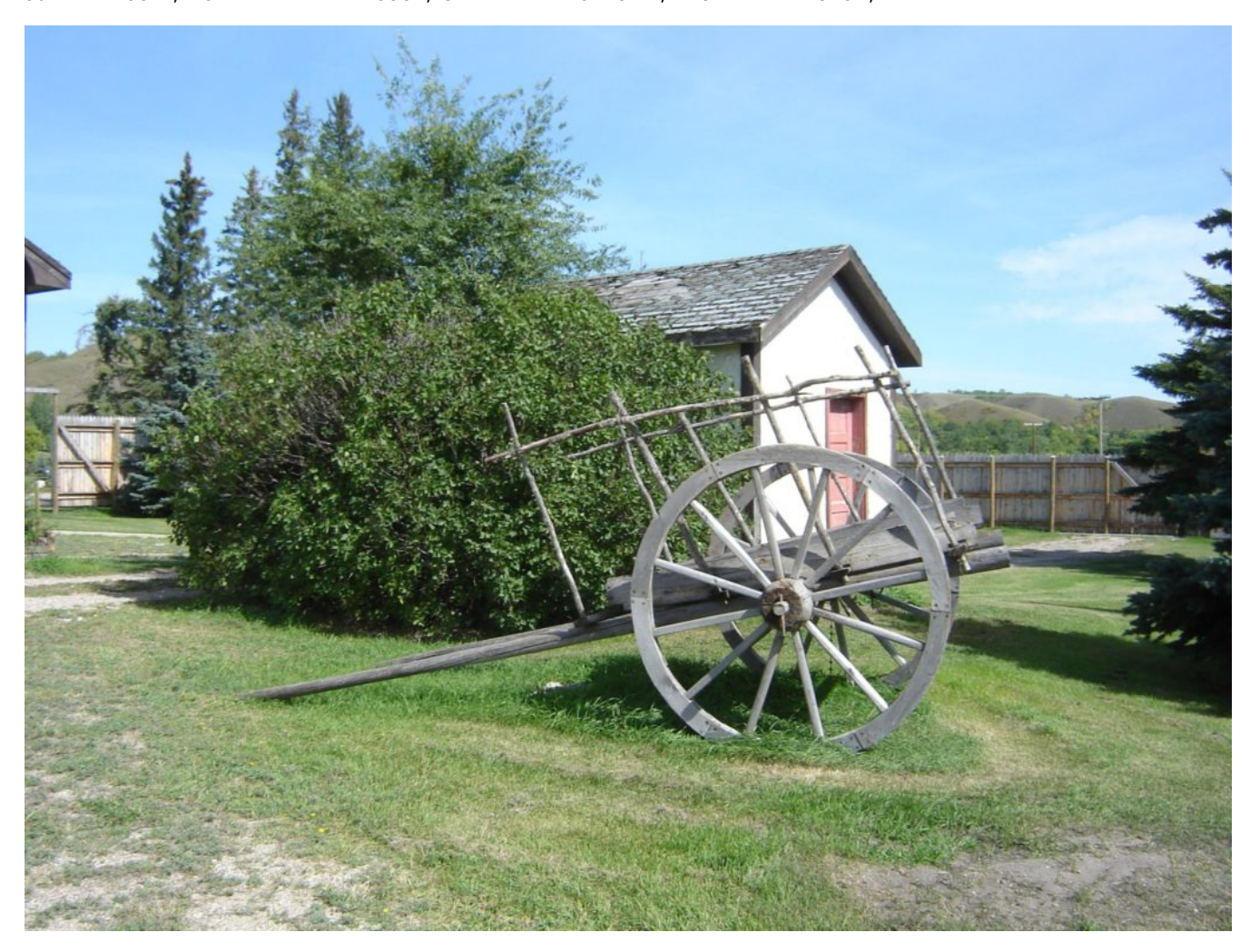
Fig 3.1: Red River Cart at RE-built fort at Fort Qu'Appelle Saskatchewan.