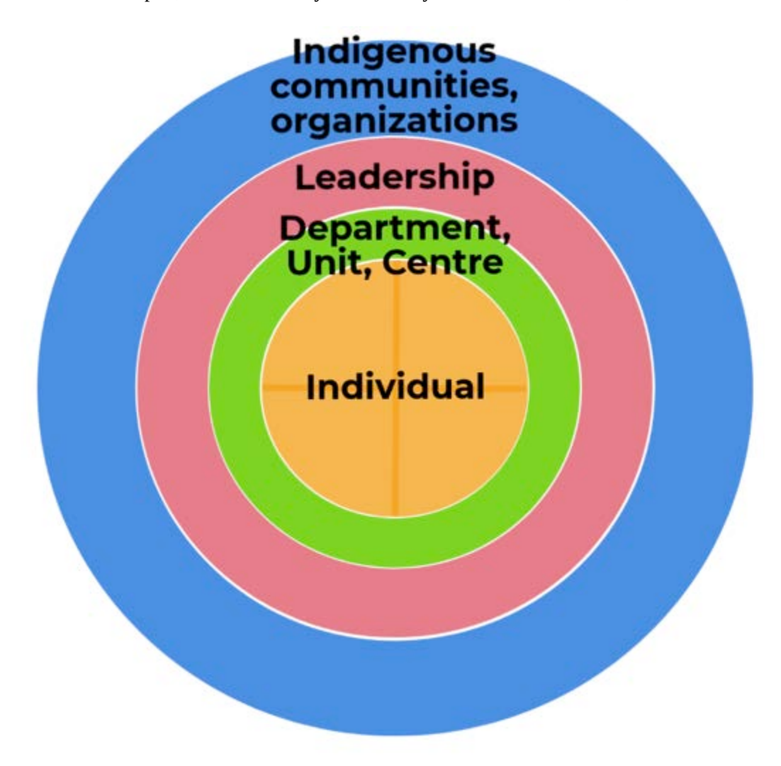
Fig 2.2: Institutional interconnections to Indigenization.

Indigenization in practice is deeply grounded in the traditions and cultural protocols of the traditional landholders that an institution is built upon; it is informed by the diversity of First Nations, Métis, and Inuit of Canada.