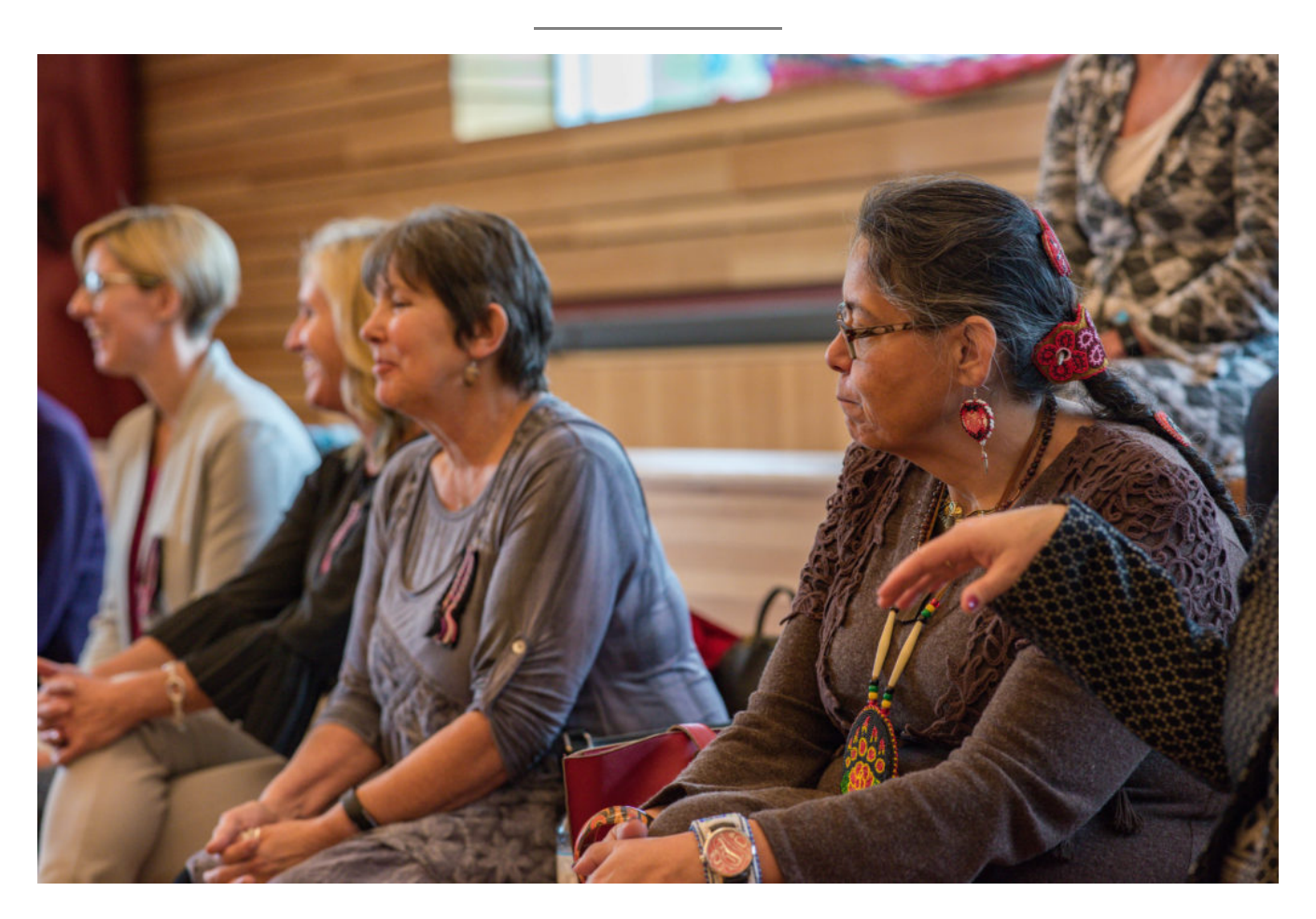
Fig 4.1: UFV – Metis Nation-BC Joint Project Announcement.