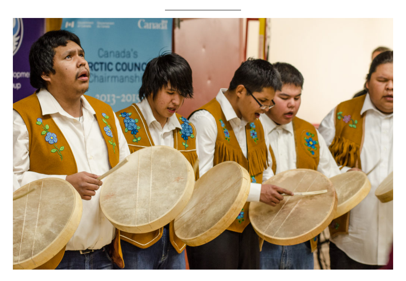
Fig 2.1: The Tlicho Drummers and the Yellowknives Dene First Nation Drummers.