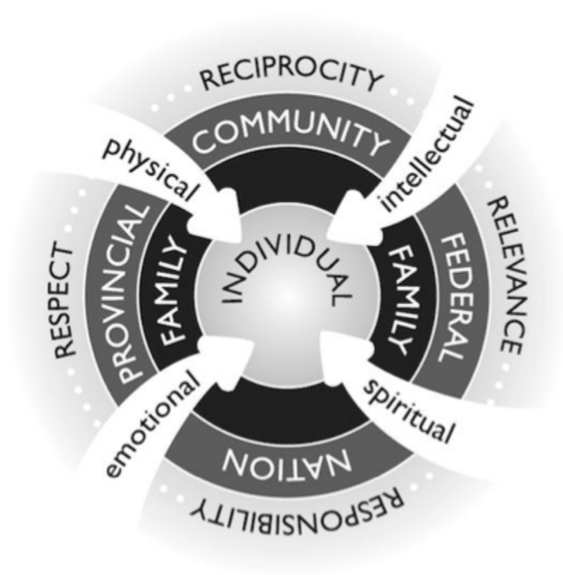
Fig 2.2: Indigenous wholistic framework.

This Indigenous wholistic framework provides guiding principles to ensure post-secondary institutions become accessible, inclusive, safe, and successful places for Indigenous students as follows: