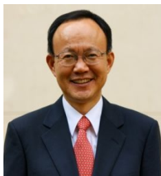
Taeck-Soo Chun, Ph.D. Secretary-General The Korean National Commission for UNESCO

While Korea is growing into a multicultural and multiethnic society, the problems it faces are also getting more complex. Issues including climate change, food shortage, world poverty, and cultural conflicts are not limited within the country. As many issues are complexly entangled with each other and with other countries, our lives are greatly affected by this. Consequently, these phenomena will inevitably spur a big effect on the youth as well, in their very lives and the formation of values.